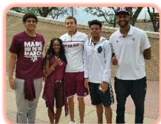
(Stopped for a pic with the 2016 SEC Basketball Conference Champs - Texas A&M at the Maroon & White Spring football game)