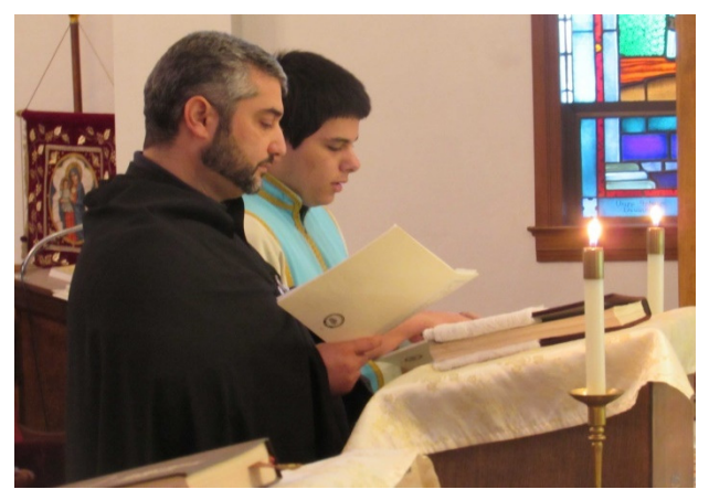
•Rise early and worship together at sunrise