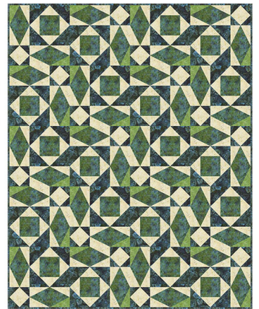
EQ Original Design with Storm at Sea Block