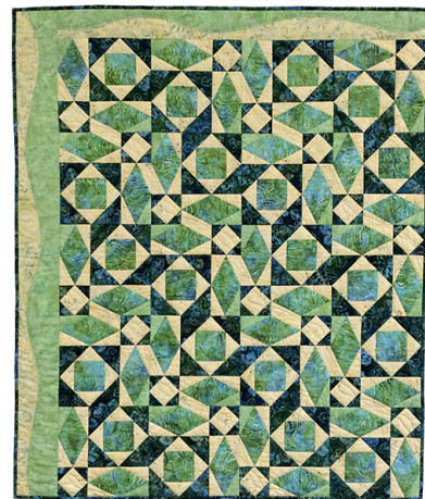
Finished Quilt: 48 x 40 inches

Note: No Experience is required with EQ8.. But, students need to have basic computer skills, such as the ability to load software, use a mouse or trackpad, find and open the software, and find files on their computer.