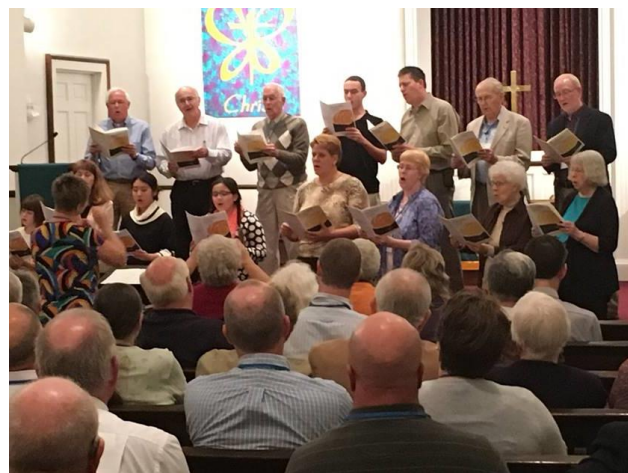
FBC Choir at Regional Convention