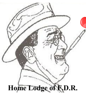
Home Lodge of F.D.R.