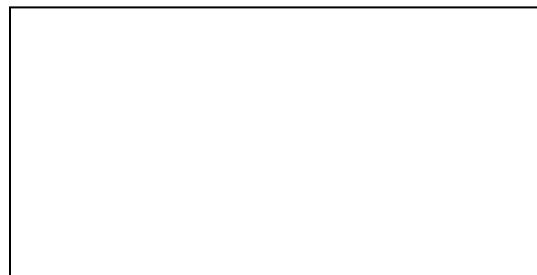
This space may be used for the Prescriber's Address Stamp

Prescriber's Signature: _____ Date: _____ (Original signature or signature stamp ONLY)