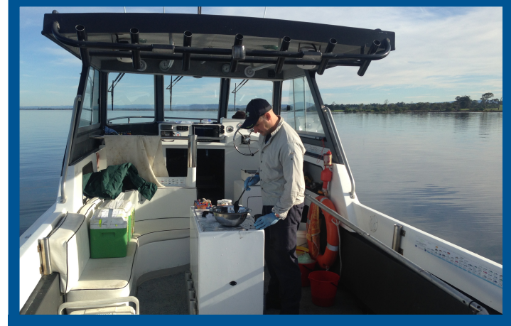
WATER, SEDIMENT AND METOCEAN

Our team has developed survey and monitoring techniques for both mobile water quality monitoring, as well as fixed site instrumentation, including: