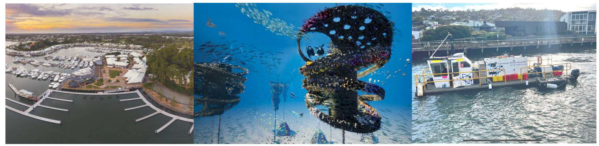
Mulpha, Sanctuary Cove Marina