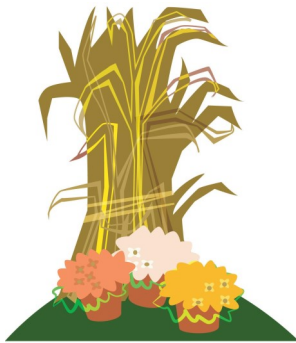
CELEBRATING IN NOVEMBER