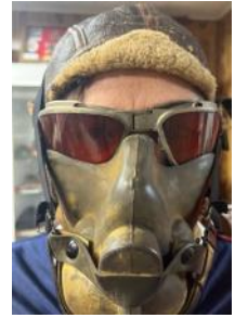
5) WWII B-17 Gunner Helmet & Mask