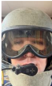
6) Vietnam War Tanker's Helmet and Goggles