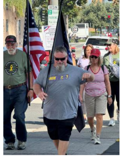
Various Pics at the Post