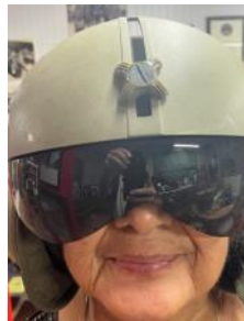
7) Helicopter Pilot Helmet with Visor