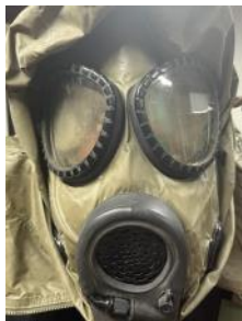
2) MOPP 4 Gas Mask