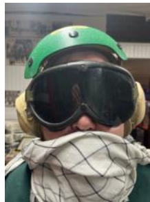
8) Navy Flight Deck Helmet and Goggles