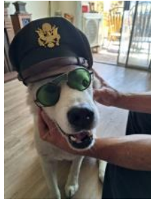
3) Nagasaki Blast Goggles & “Crusher Cap”