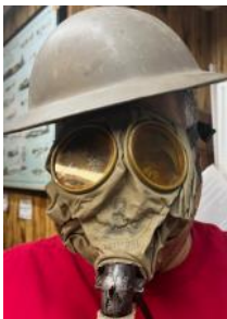
1) WWI helmet & Gas Mask