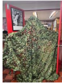
4) WWI Helmet with Body Camouflage