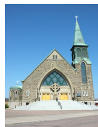
Saint Augustine's 340 Dominion Street Moncton, NB