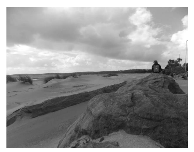
First time seeing Swansea Beach.

the 1100's. We walked all through Singleton park, where there were gorgeous botanical gardens we basically had to ourselves. At a walk around campus with the international students, we wouldn't know it but we had met who would become some of our best friends in Swansea for the next three months.