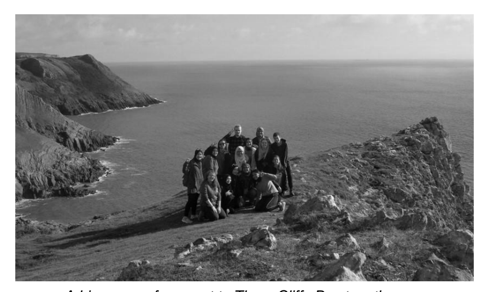
A big group of us went to Three Cliffs Bay together.

It's strange how looking back I don't have one single favorite memory, but a general overwhelming fondness for Wales and the people I met there. The experience is hard to put into words but it's one I will cherish forever. I want to thank The Welsh Society of Central Ohio for the generous scholarship making it possible for me to have this opportunity. I have never felt more myself than when I was in Wales, and I know many people have had this same feeling. I am extremely thankful that I was able to be somewhere that makes goodbye's so hard. A part of me will always be with Cymru!