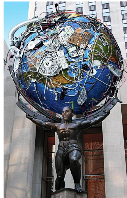
Depiction of Barack Obama posing as "Atlas" while trying to hold up a globe full of "pointless confusion." – or so I say - SB

The government has a "fair share law" which: