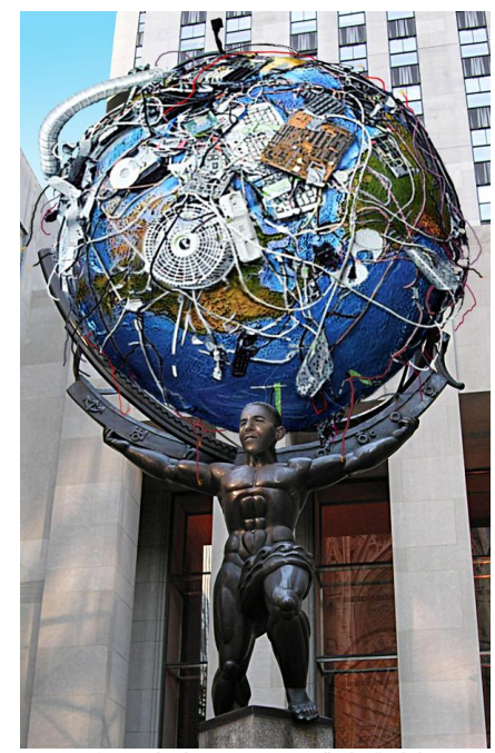
Depiction of Barack Obama posing as "Atlas" while trying to hold up a globe full of "pointless confusion." - or so I say - SB

The government has a "fair share law" which: