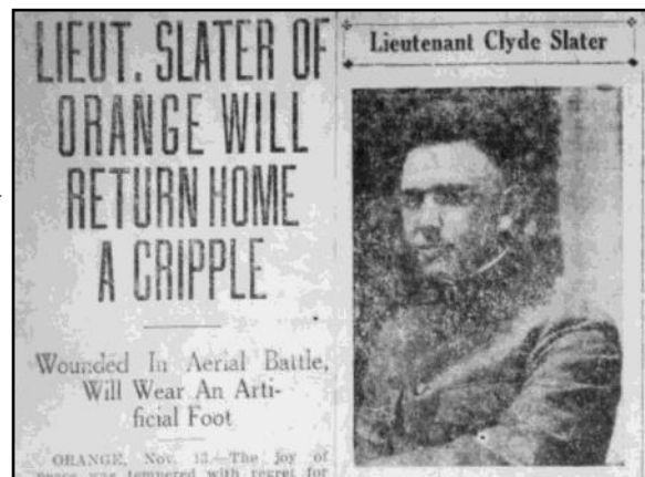
Santa Ana Register article from November 1918.