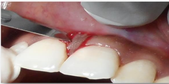
Figure 3- incision