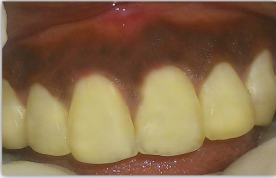
Figure 13 - one week post operative