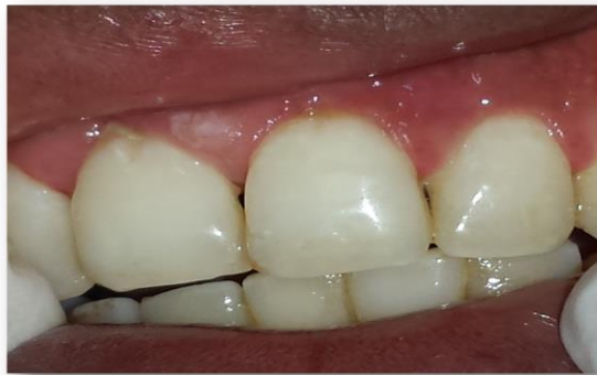
Figure 10- one week post operative