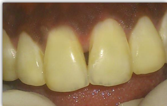
Figure 12- class I interdental papilla loss between 11 and 21