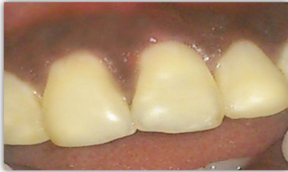
Figure 14- three months post operative