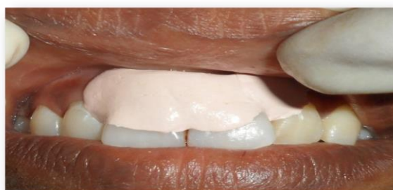
Figure 6- periodontal dressing placed