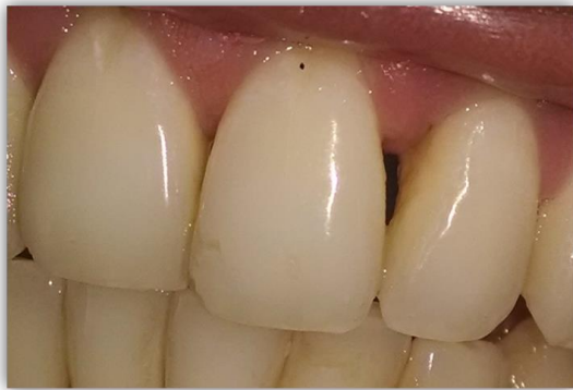
Figure 9 – class II interdental papilla loss between 21 and 22