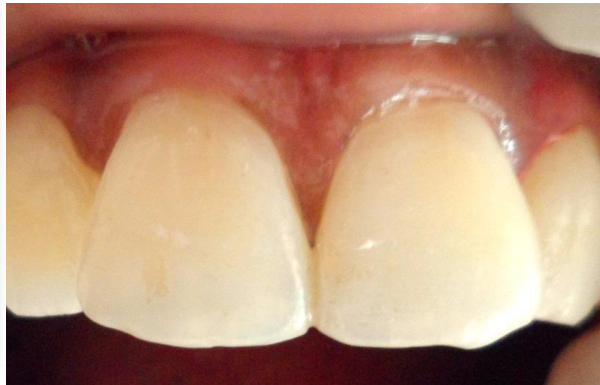
Figure 8- three months post-operative