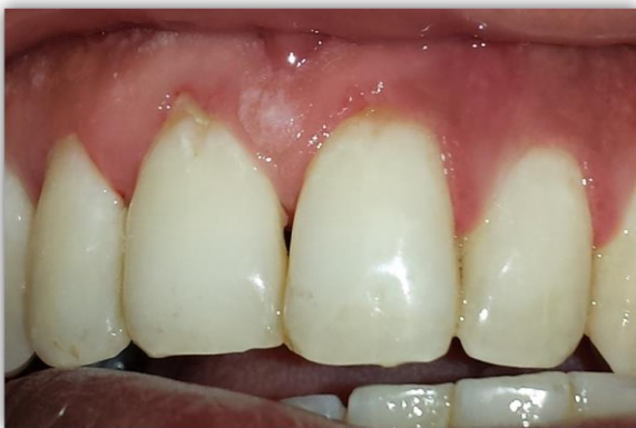
Figure 11 – three months post operative