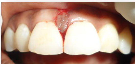
Figure 5- flap slid down to obliterate the open embrasure