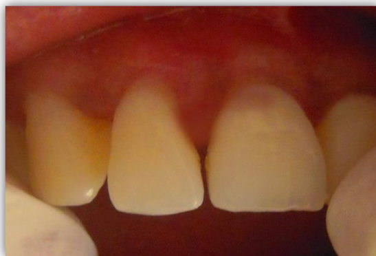
Figure 17- three months post operative