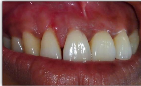
Figure 16- one week post-operative