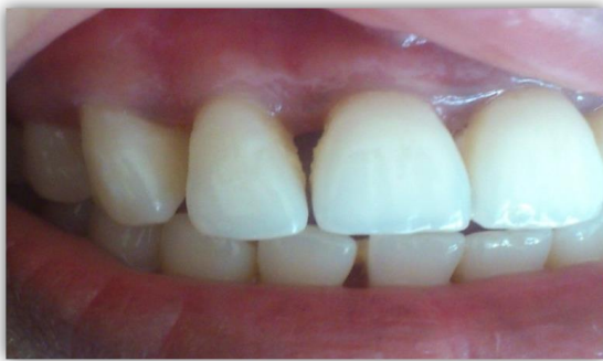
Figure 15- class II interdental papilla loss between 11 and 12