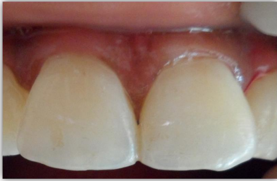
Figure 7- one week post operative