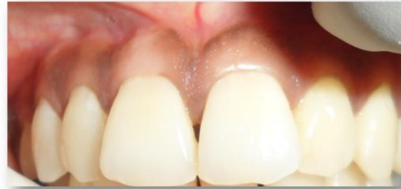
Figure 2 – pre operative class I interdental papilla loss between 11 and 21