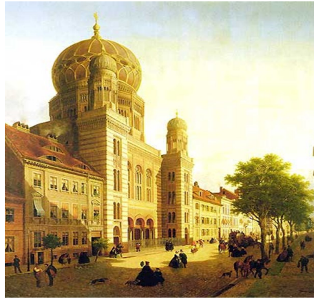
Die Neue Synagoge in der Oranienburgerstrasse (The New Synagogue built in the 19 th century on Oranienburgerstrasse in Berlin)

Beth Shalom of Whittier presents a special Shabbat evening service with music composed by Louis Lewandowski for Berlin's Oranienburgerstrasse Synagogue in remembrance of the German Synagogue choral tradition and commemorating Kristallnacht.