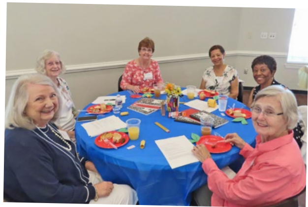
Great smiles abound at this table.