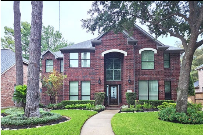
7822 ADAGIO AVENUE