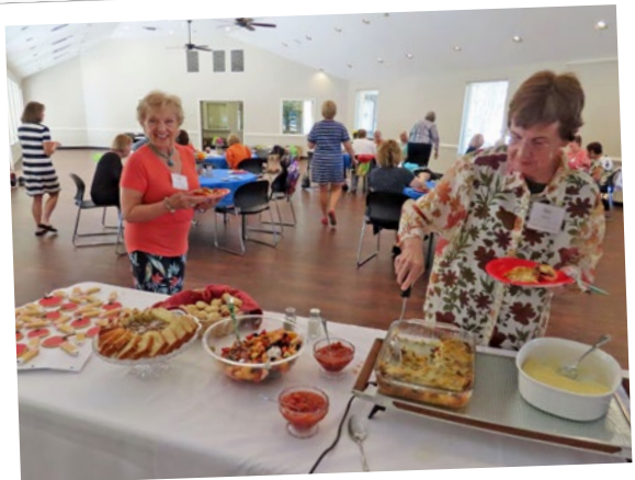
Enjoying good food with good friends.