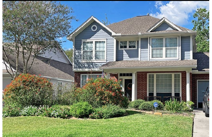
9322 SINFONIA DRIVE