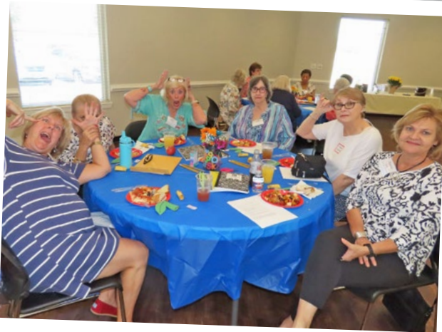
Decorum is not always enforced when having a good time.

Having a good time while working for good causes is what this group is all about.