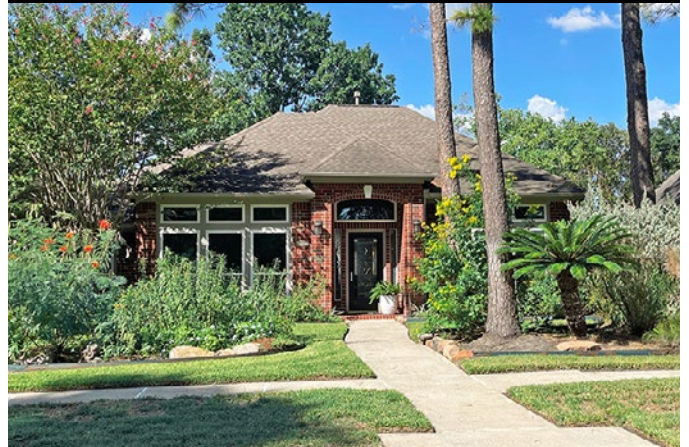
8822 ANDANTE DRIVE