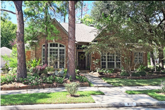
9111 BRAHMS LANE