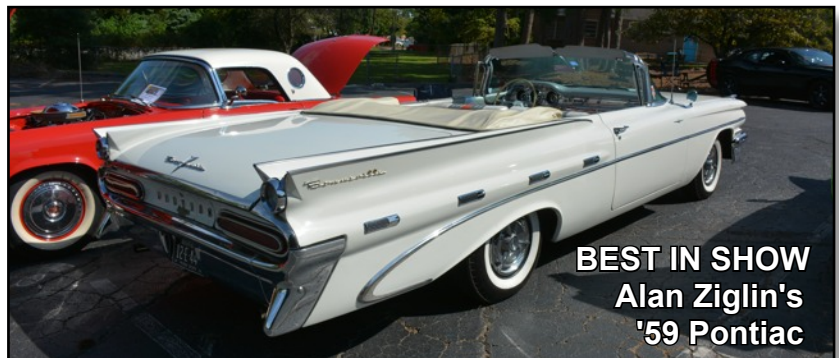
BEST IN SHOW Alan Ziglin's '59 Pontiac