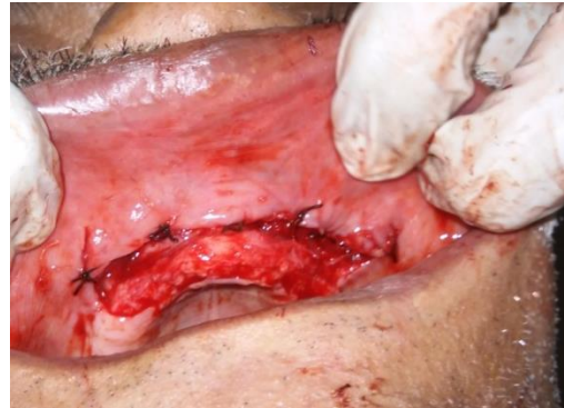
Figure 4: Immediate Post Op