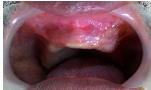
Figure 5: 1 Month Post Op