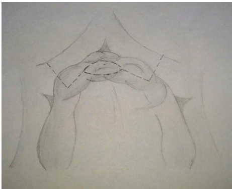
Figure 1: Incision Outline