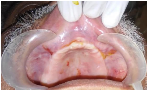
Figure 2: Pre Op Vestibular Depth