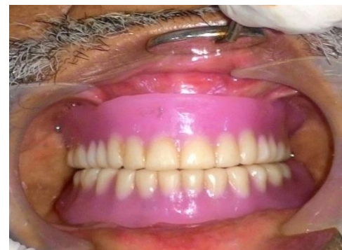
Figure 6: After Prosthetic Rehabilitation