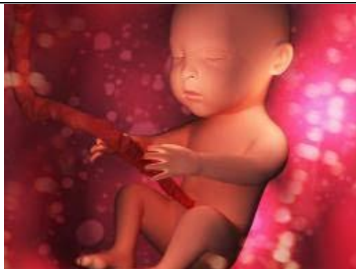
Stages of Human Life - Month 8

Register online at www.hbgdiocese.org/women