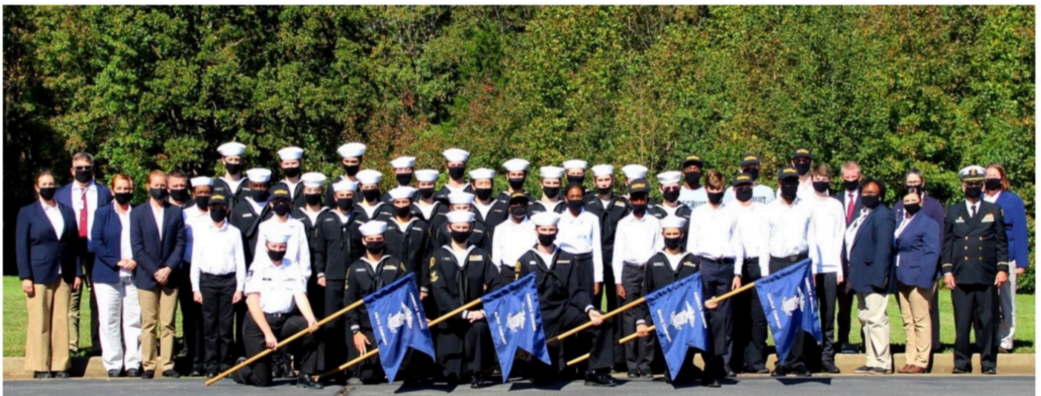
AMERICA Division Sea Cadets, League Cadets, Staff and Instructors during these unprecedented COVID times