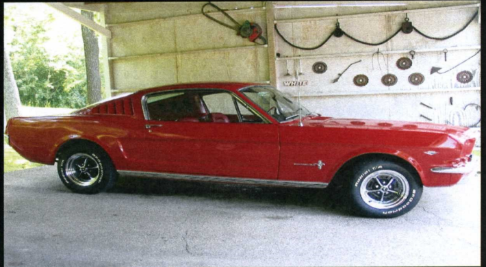
~150 HOURS & ~$12K (SEPTEMBER 2003)