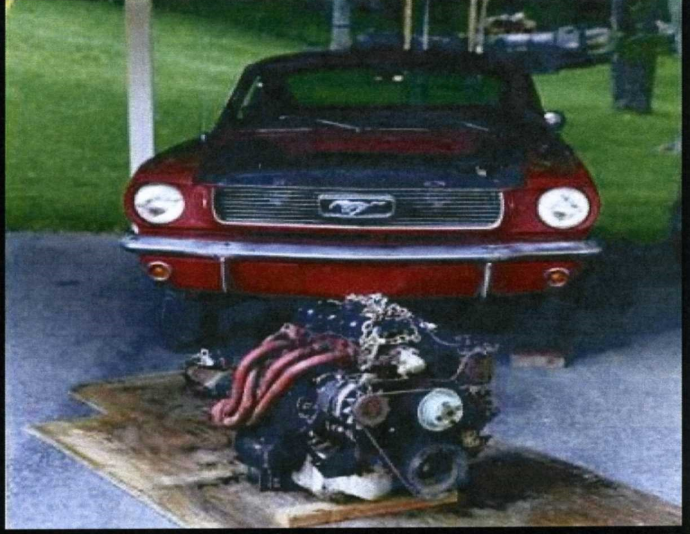
REMOVED DIESEL ENGINE (2001)