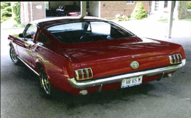
RESTORATION COMPLETED (SEPTEMBER 2003)