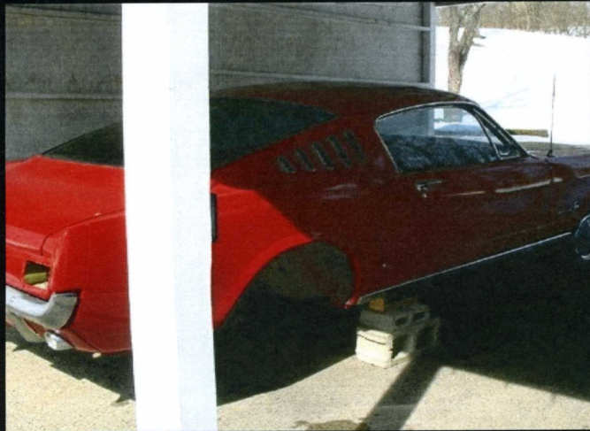
BODYWORK (MARCH 2003)