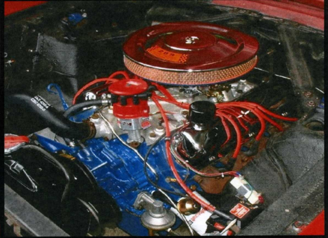
ENGINE & DRIVETRAIN (JULY 2003)