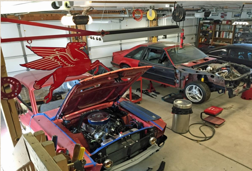
Terry's Current Projects

In closing, here's some advice -- take advantage of our variable Colorado weather -- when it is beautiful, get out and enjoy driving your Mustangs. When it's not, head out to the garage to build, clean, tinker or just soak up the glow of those beautiful pony cars we own. See you on the 28 th for the drive to the Shelby Museum!