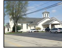
February 23, 2020

Want to stream movies through your Internet service? FORMED has movies for your viewing pleasure that can also help you grow in your Catholic Faith. There are movies for kids and families. To register go to nsoregion.formed.org and sign up.