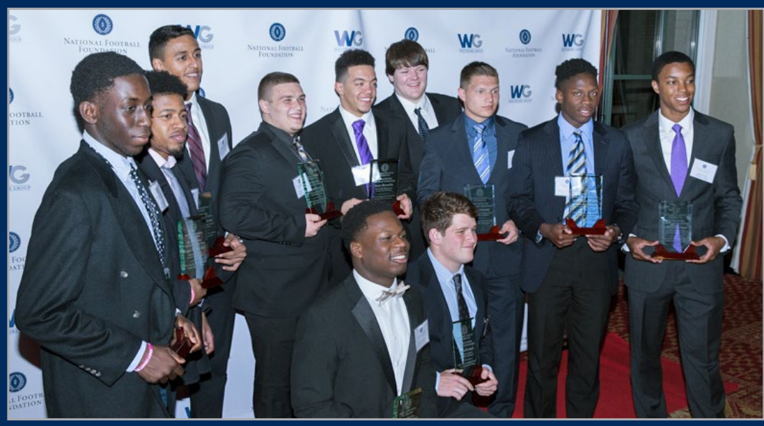
The NYC Chapter recognized 11 standout performers from the New York City area for their accomplishments on the field and in the classroom and community. Each honoree received a $1,000 scholarship.