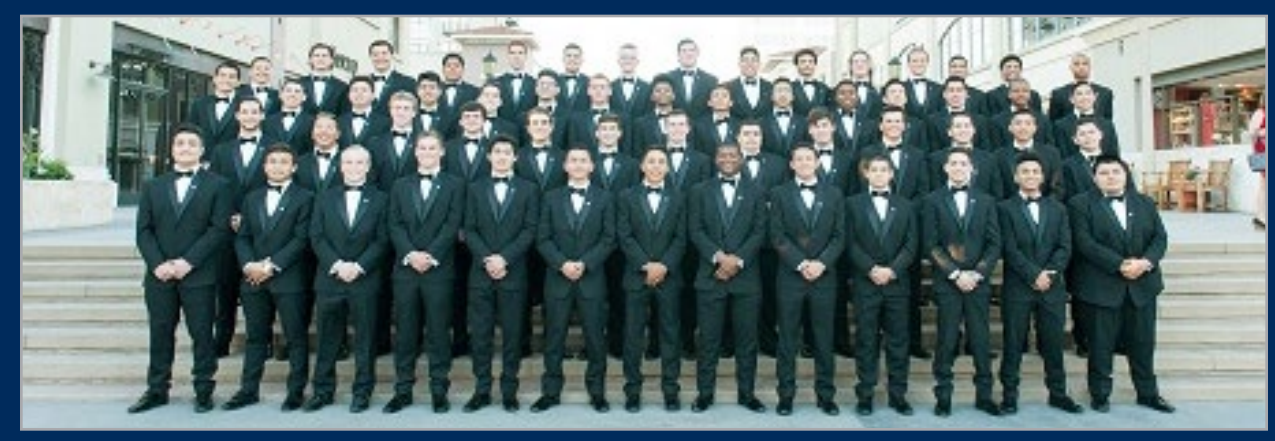
Seventy-two high school scholar-athletes claimed honors and a total of $18,000 in scholarships. The chapter has increased the number of scholar-athletes significantly in the past several years.