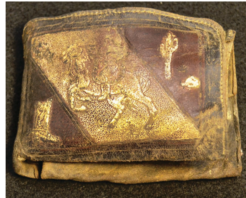
Historic wallet melting from an ice patch in Grand Teton National Park. Based on the preserved contents of the wallet, it appears to have been lost by a fourteen-year old boy—Gordon Stokes—in 1947 while he was visiting the local Boy Scout camp. Conservation: Spicer Art Conservation.

Yellowstone Area ice patches. The prey species illustrate that hunting was a primary activity at these features; however, other types of organic artifacts recovered at these locations, hint at a broader use of the alpine. While few in number, perishable ice patch artifacts enhance evidence provided by the abundant, durable stone tools being identified and documented in alpine archaeological landscapes writ large. These records seem to reflect repeated occupations by family units—or still larger groups—taking advantage of a seasonally enriched biome. The archaeological record demonstrates repeated use of ice patches by Native Americans for millennia, suggesting they were an important element of their sociocultural and geographic landscape.