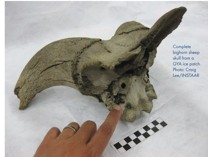
Complete bighorn sheep skull from a GYA ice patch.

Chipped stone projectile points, bows, dart and arrow foreshafts and shafts, and the remains of prey species—certainly bighorn sheep ( Ovis canadensis ) and probably bison ( Bison bison ) as well—have been recovered in direct association with melting Greater