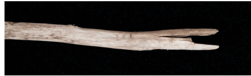
Detail of 10,300-year-old foreshaft showing ownership marks.

Ice patches in the GYA.