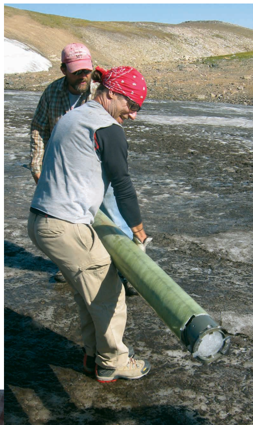
Chronologically stratified ice recovered from ice cores provides context for archaeological and paleobiological materials exposed by current melting.