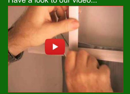
Ask For A Free Quote