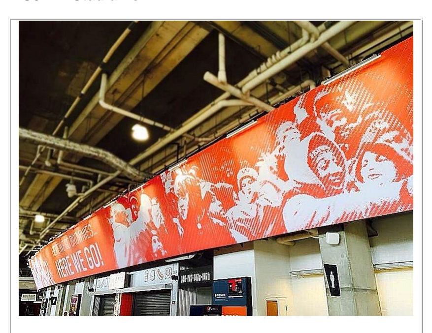
TS32 - Cleveland Browns Stadium- Food court Banner stretched on a 310' by 13' existing steel frame.