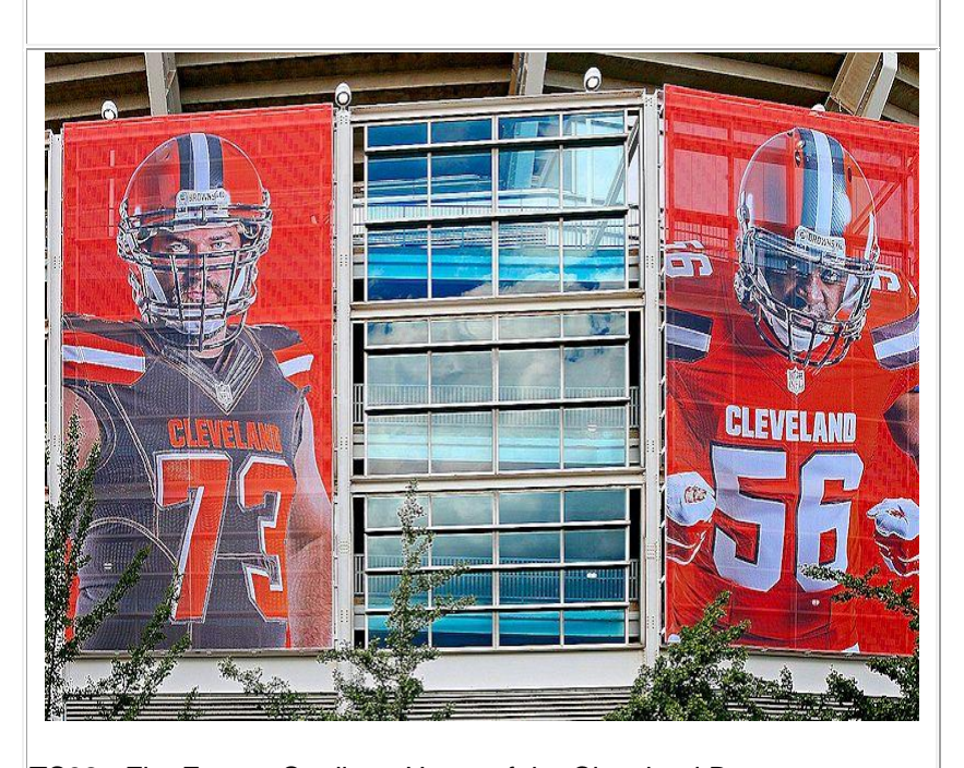
TS32 - FirstEnergy Stadium, Home of the Cleveland Browns. Two of eight 22' x 42' stretched mesh banners