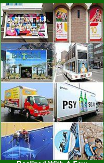
Realized With A Few Extrusions...!