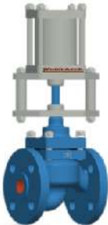
PNEUMATIC OPERATED PISTON VALVE