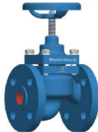
HAND WHEEL OPERATED PISTON VALVE

ALSO AVAILABLE: FLUIDCHECK BUTTERFLY VALVE, DIAPHRAGM VALVE, PINCH VALVE, SWING CHECK VALVE