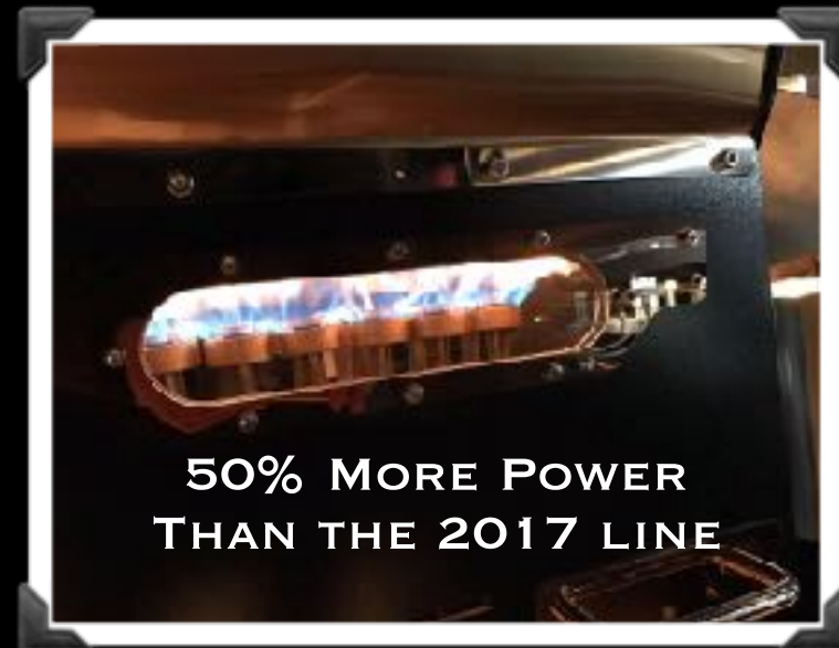
50% MORE POWER THAN THE 2017 LINE