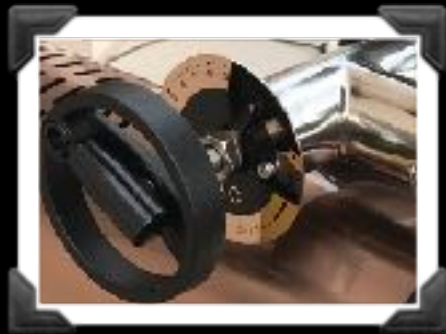
PRECISE MDDS AIRFLOW