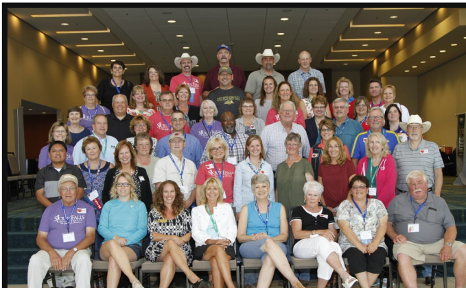
Northwest Area Attendees