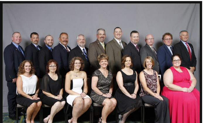
NASCOE Executive Board and National Chairs