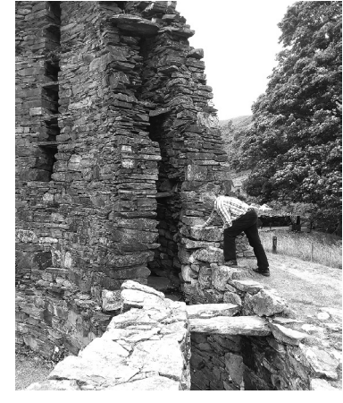
Fall 2018 Page 9

When we left Skye, we took the ferry from Kylerhey to Glenelg where we had a good look around, taking in the Bernera Barracks, built between 1717 and 1723 to subdue the population after the 1715 rebellion and also the two ancient brocks, Dun Telve and Dun Troddan, which are almost equal to Dun Carloway but unknown as they are so much off the beaten path.