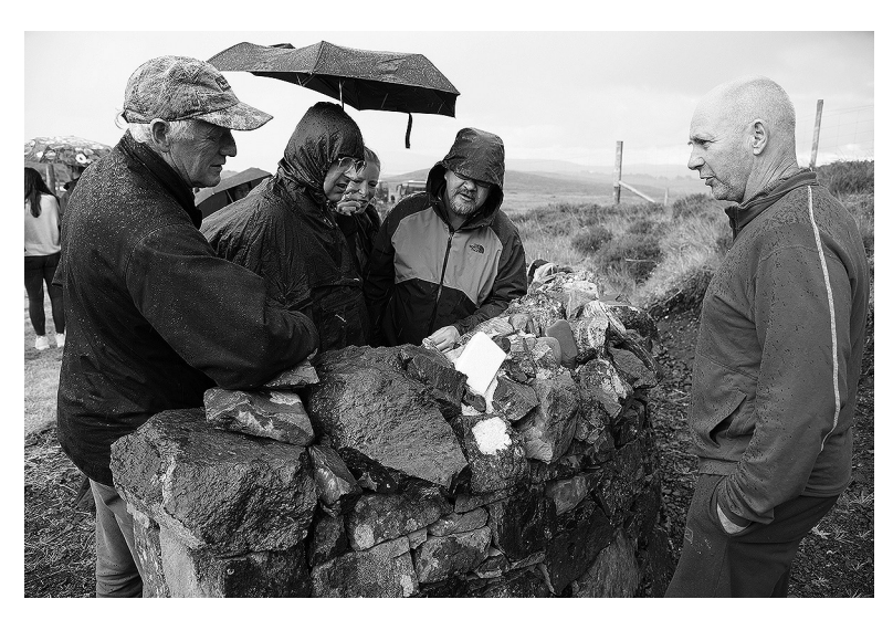
The Emmigration Wall at Orbost was a popular visiting site in spite of the showers. The special contributed stones are set along the top of the wall.

Nevertheless, we ended with a time of fellowship, tasty refreshments, and a wish to do the same again at some not-too-future date! Evidently the SFU Scottish Studies—and whisky tasting—is continuing alive and well! \Delta