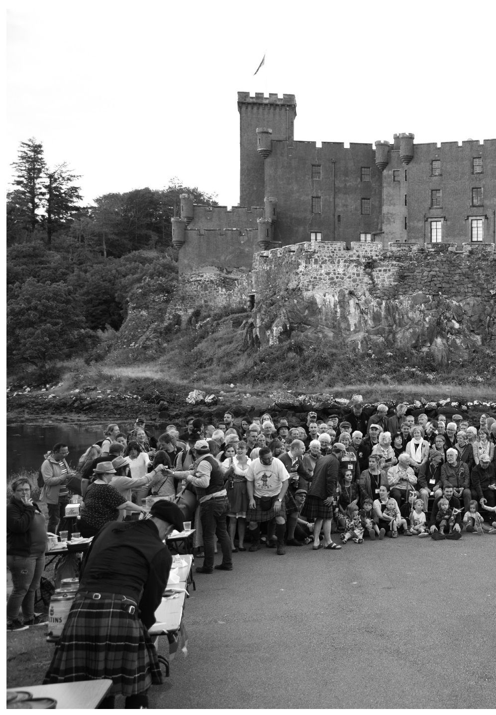
The official photo for Parliament 2018 was somewhat more informal this y you might even recognize a few. Significant is the large number of