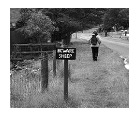
CMSC Newsletter # 69, Page 10