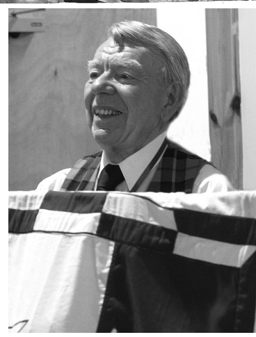
Fall 2018 Page 29