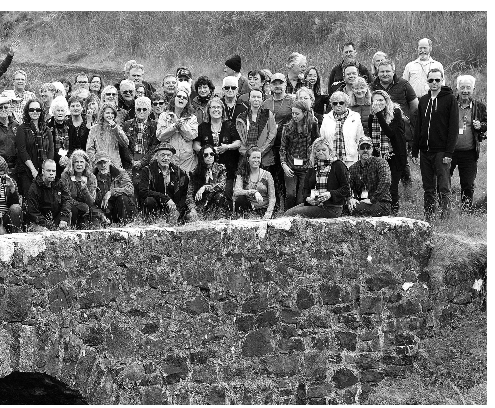
Waternish bus crowd assembled on the Fairy Bridge