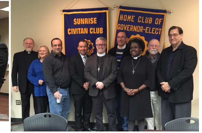
Clergy present Thank you for what you do!!!