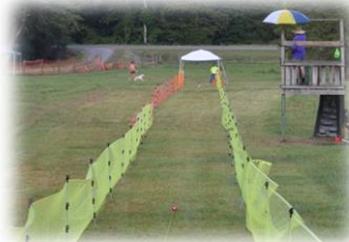
An AKC photo of a Fast CAT set up in N.C. A dog chases the bunny down this 100 yard run

Fast CAT and Course Ability are fun activities for dogs. No training lessons are required and an owner in poor physical shape can enter and participate with his/her dog. And most dogs LOVE it.