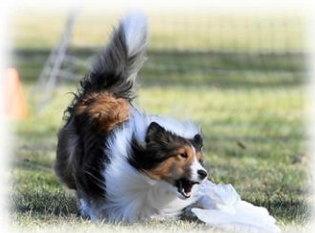
Bennett going for the grab!

Below are some photos of Fast CAT runs and an AKC photo that depicts how the Fast CAT course is set up for the 100 yard dash. There is a fenced area to release your dog and a longer area to catch you pup.