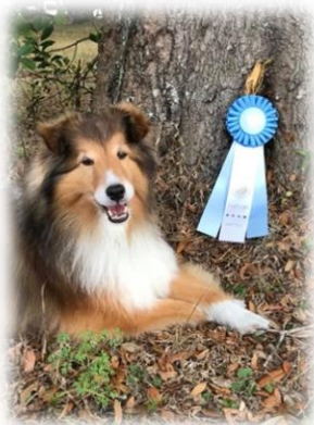
UACH VTCh Taliesin Midnight Train to Georgia "Savannah" URO1, CD, BN, RE, RA, RN, HIA-d, HAS-dm, HAS-d, NA, NAJ, NJP, CAA, BCAT, CGC, RLX3, ARCH, RLX2, RLX1

January 2018, Brooksville, FL: Savannah earned her BCAT Title for Fast CAT. The following day Annie earned her BCAT Title for Fast CAT and CA Title for Course Ability.