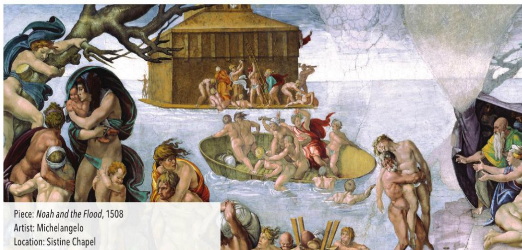
Piece: Noah and the Flood, 1508

What important lessons have I learned from a challenge in my life? Maybe I can share that lesson with a friend or family member.