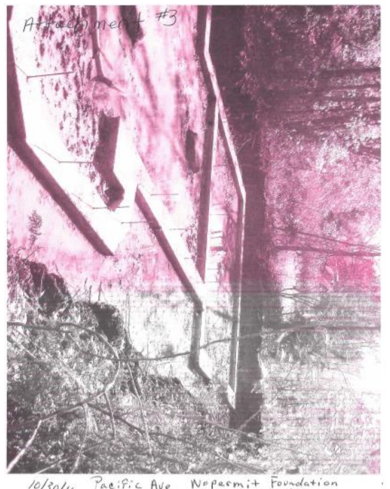
10/30/16 Pacific Ave Nopermit toundation under water