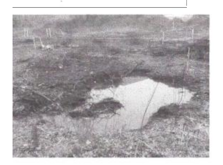
7944 Atlantec March 2014 before foundation