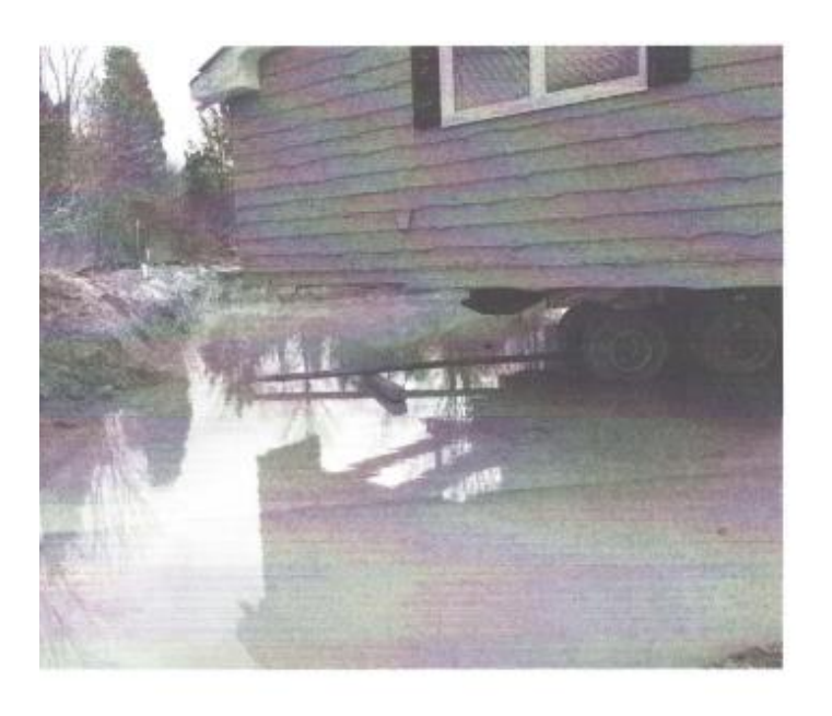
12-28-14 Slab Foundation under water