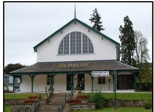
Strathpeffer Spa Pavillion

Evening: Buses to Inverness for tour of the Highland Archive & Registration Centre, followed by Civic Reception at the historic Town House.