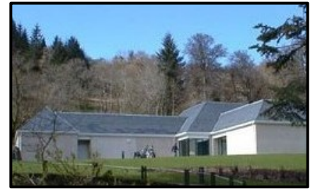
Clan Donald Centre & Museum of the Isles

PM: Lunch in restaurant at Clan Donal Centre, then bus to Kintail for tour of the ancient Clan MacKenzie stronghold, Eilean Donan Castle (above) - now in the care of Clan MacRae.