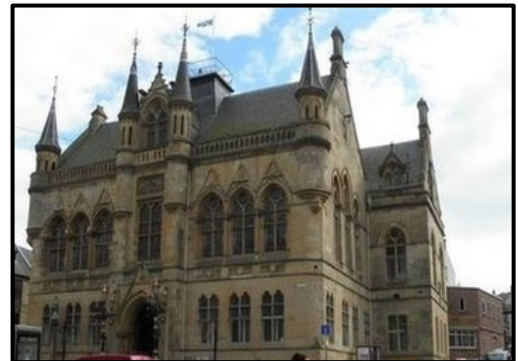
Inverness Historic Town House