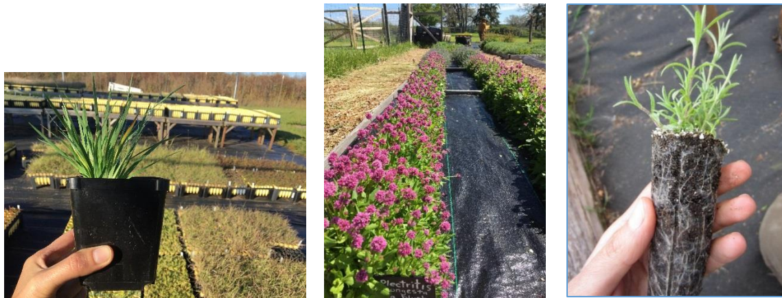
Photos, left to right: Sisyrinchium idahoense 4" pot; sea blush seed production; Cerastium arvense plug.

Please bear in mind that some of our native species require fall sowing in order for germination to occur, which can mean planning for your project well in advance.