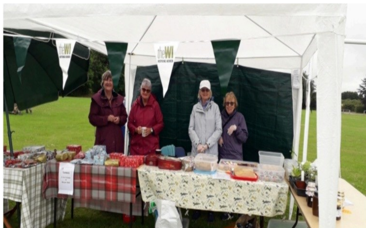
Norton WI's stall at Norton Parish Gala

Despite Sunday the 14th July turning out to be a drizzly and dull day for our Parish Gala, the ladies of Norton WI were in good spirits as we raised £122 for local charities from the tombola and sale of cakes, preserves and plants.