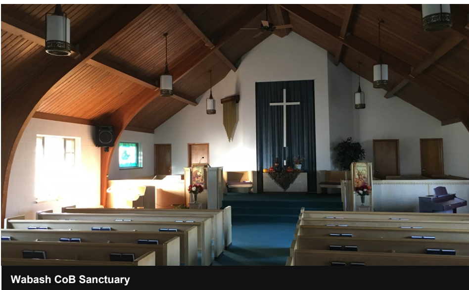
Wabash CoB Sanctuary

We welcome all who are on the journey to know Jesus, who share in his love and who choose to embrace the diversity within this community of believers. As individuals we may be at different places along the path, but as a community, we are all traveling together in faith, trusting God to show us the way.