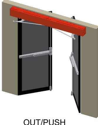
(doors swing away from Operators)