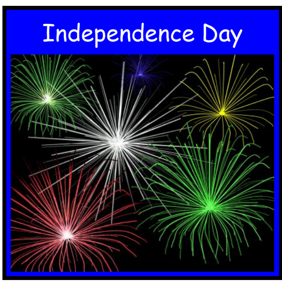
© 2010 Integreat! Thematic Units www.thematicteacher.com