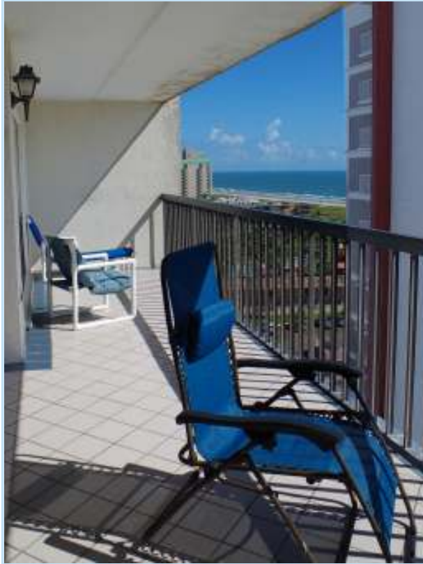
very spacious balcony