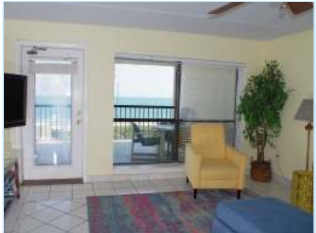
ocean view from living area