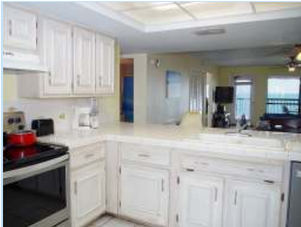
lots of cabinet space