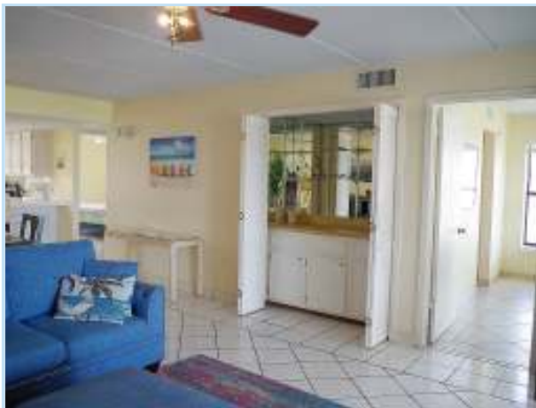
convenient wetbar in living area