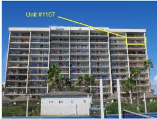
unit #1107 is on the north corner, next to top floor