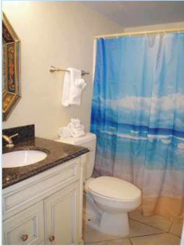
guest bath has granite countertop and tub/shower combo