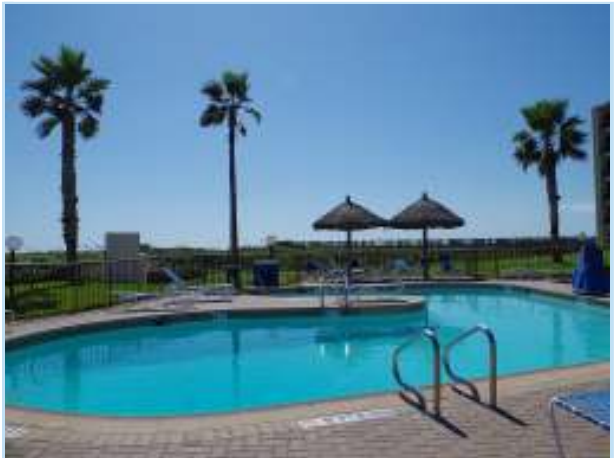
Saida Pool #2