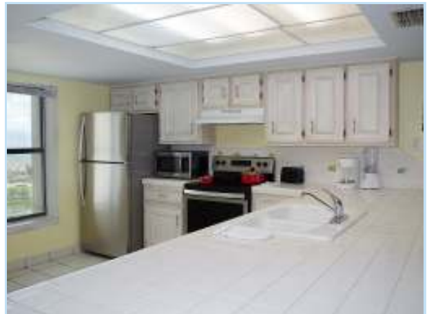
lots of counter space