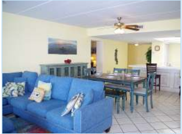
plenty of room to gather with family and friends