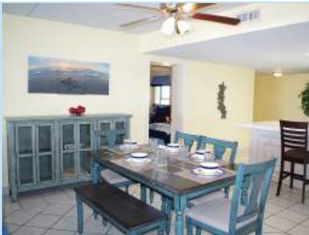
seating for 6