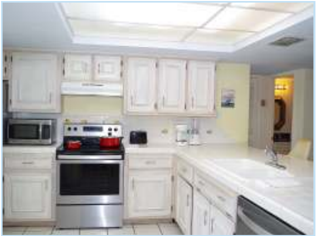
stainless steel appliances