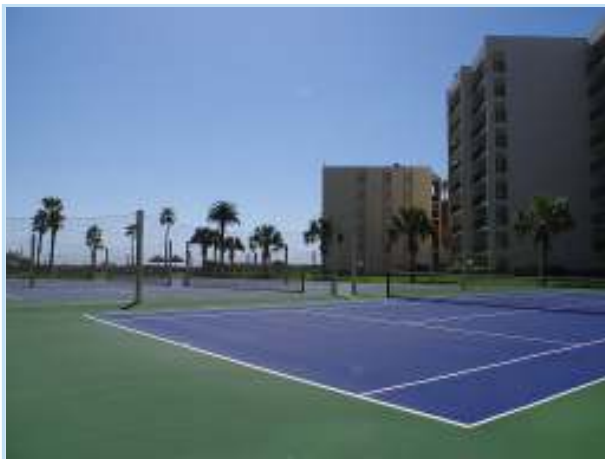
Saida has 4 tennis courts