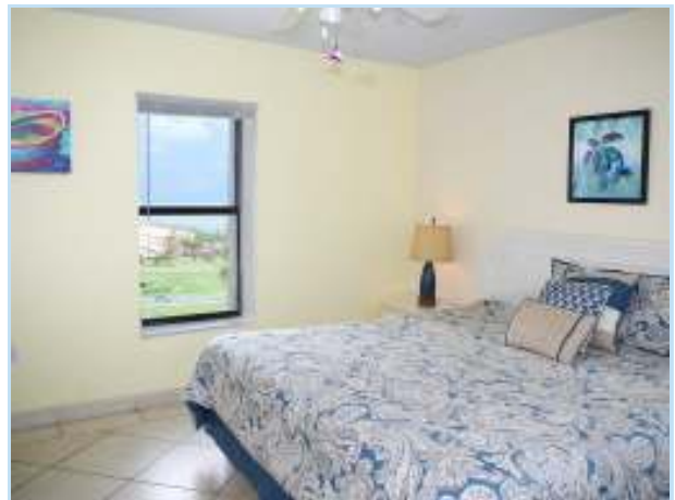
spacious guest bedroom