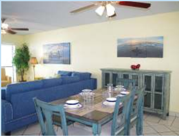
new dining rea furniture conveys with the sale