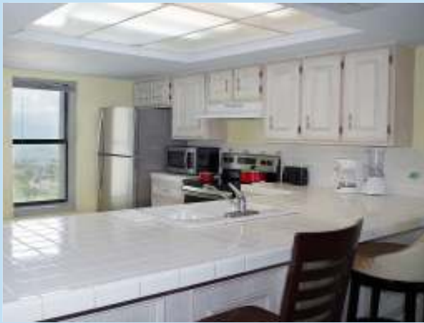
kitchen has a view of the bay