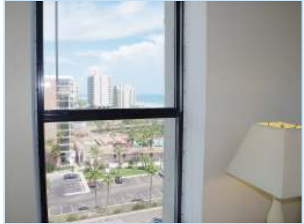
north corner unit provides additional ocean view