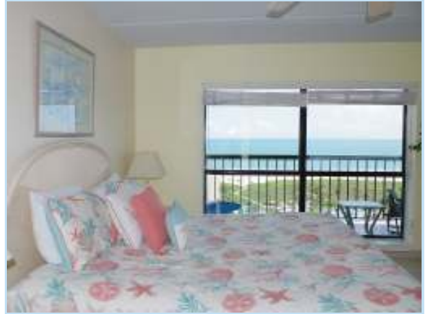
master suite has an ocean view