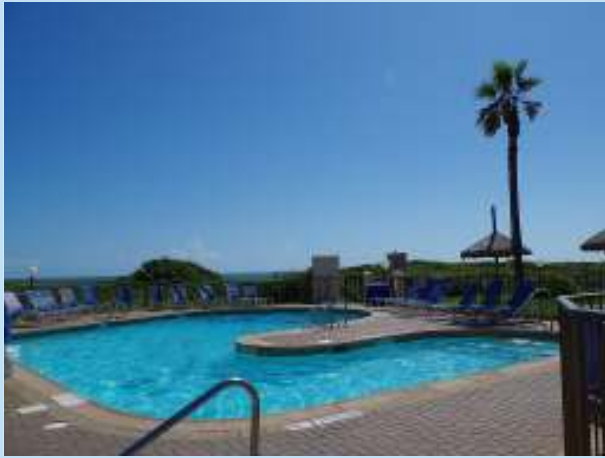
Saida Pool #1