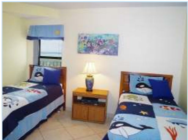
view of bay and causeway from guest bedroom