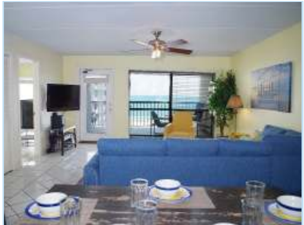
dining has ocean view