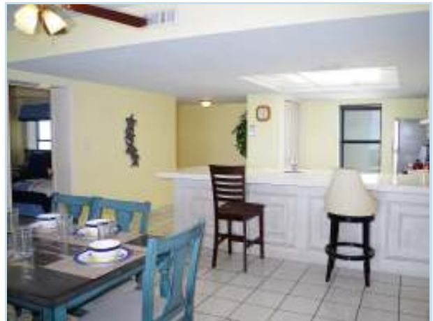
additional seating at kitchen bar