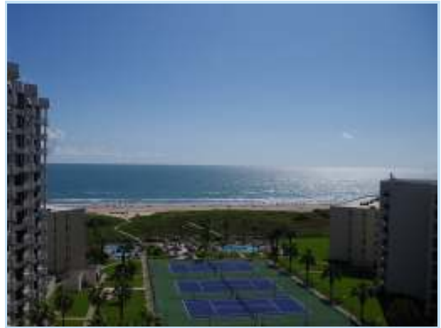
This could be your view!