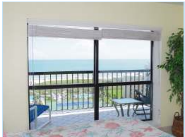
wake up and look at the ocean!