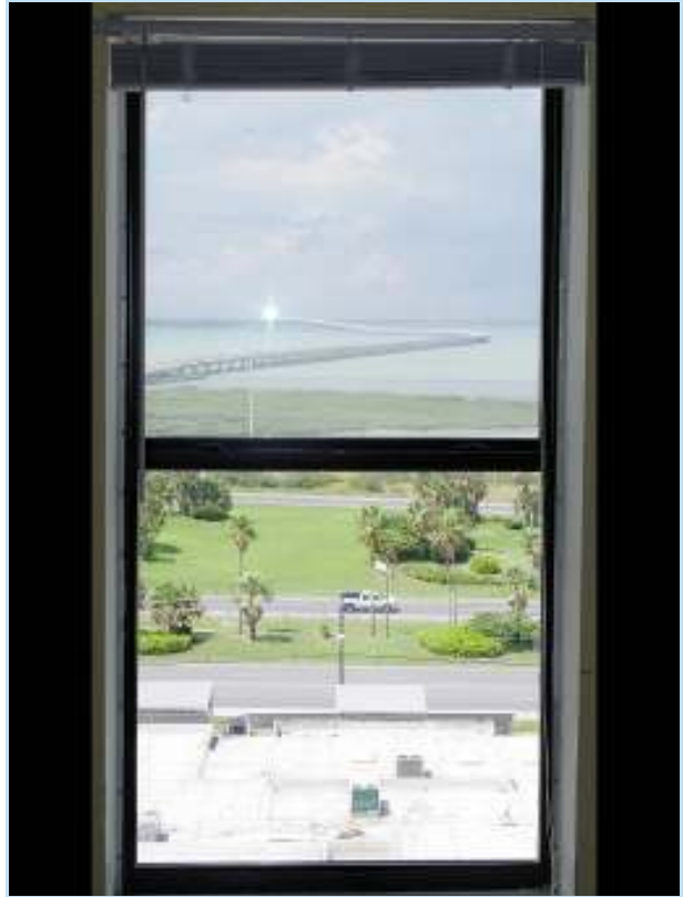
view of bay and causeway from guest bedroom