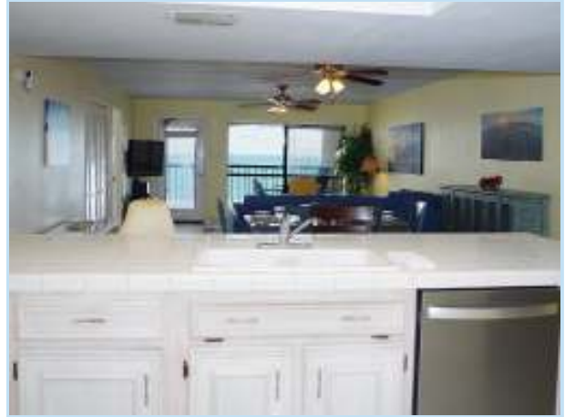
ocean view from kitchen