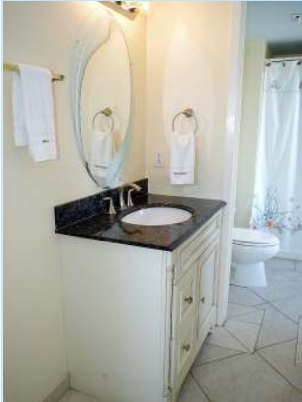
ensuite bath has granite countertop