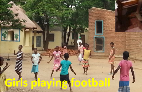
Girls playing football