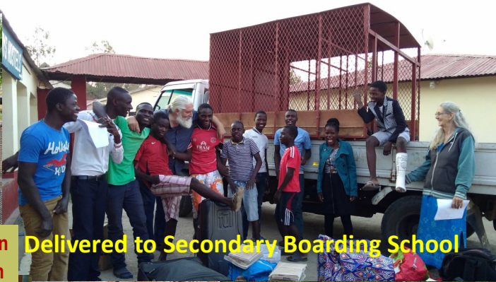
Delivered to Secondary Boarding School