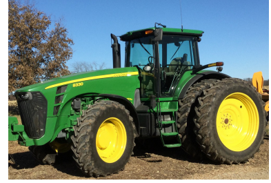
2007 John Deere 8330 MFD 4788 hrs, rear duals 480 80R50, front 420/85R34, Hydraulic 60 gpm pump, 4 outlets