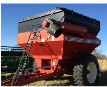
Unverferth 4500 550 bu grain cart, 1000 pto, side auger

Kewanee 12' drag harrow SEED & GRAIN EQUIPMENT