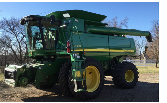
2009 John Deere STS 9770 RWA engine 2454 hrs, rotor 1509 hrs