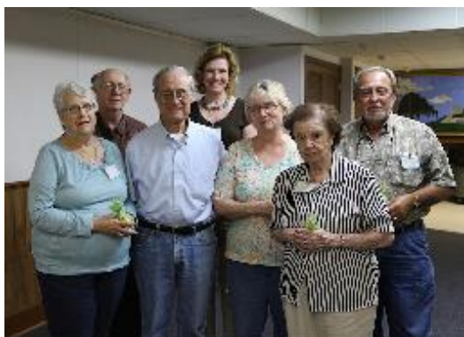
Happy Birthday and welcome!