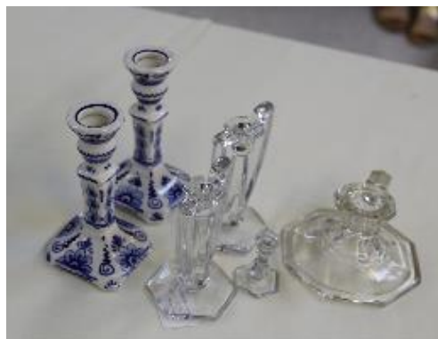
Some of the candlesticks from show 'n tell.