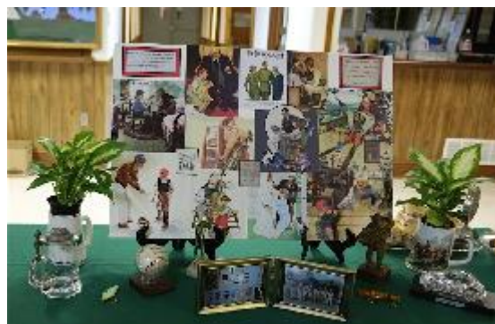
The refreshment table decoration gives a salute to dads!