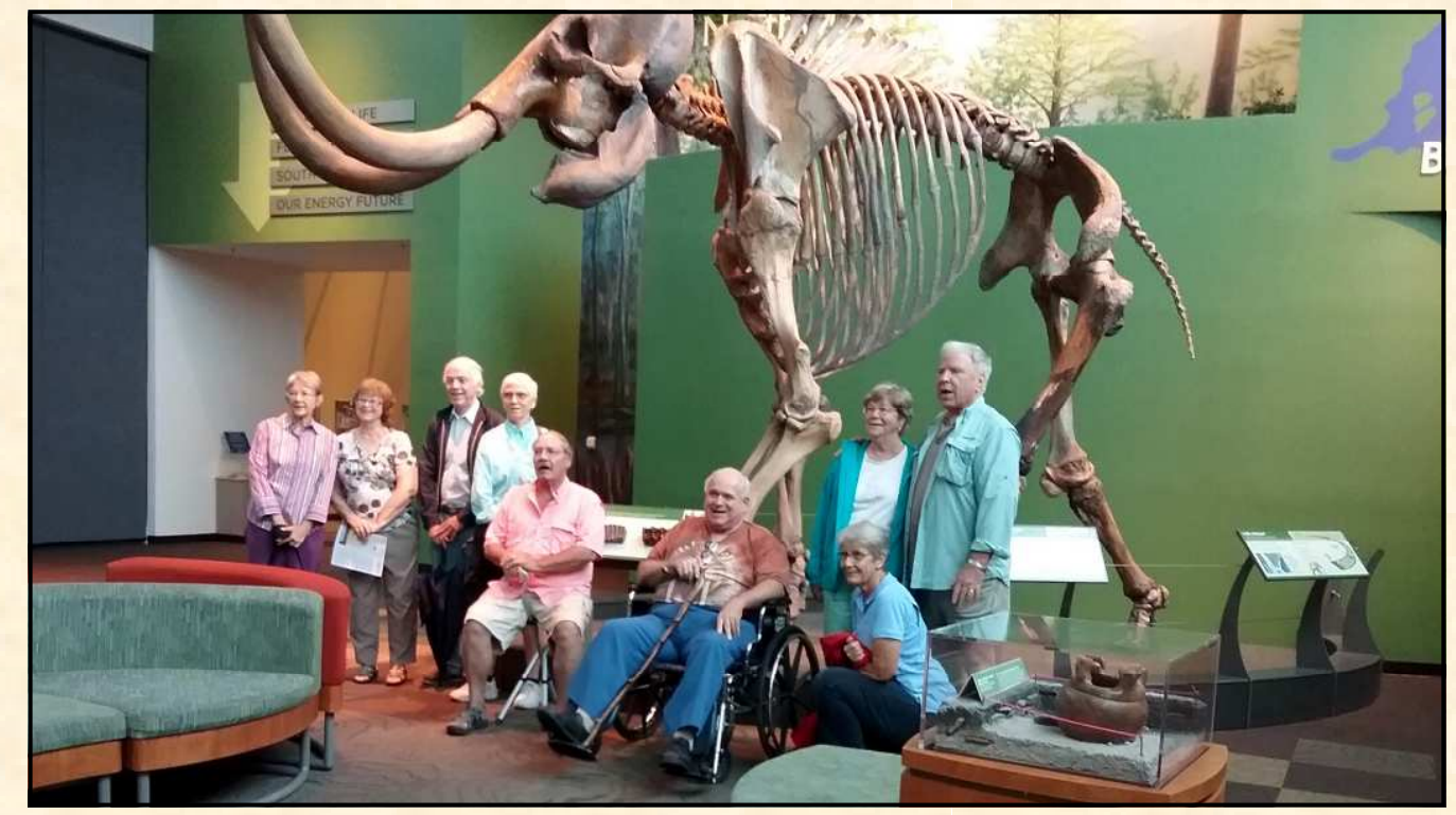
Field trip participants

Next Meeting, Wednesday June 14th, 7:00 PM at the Weeki Wachee Senior Citizens Center