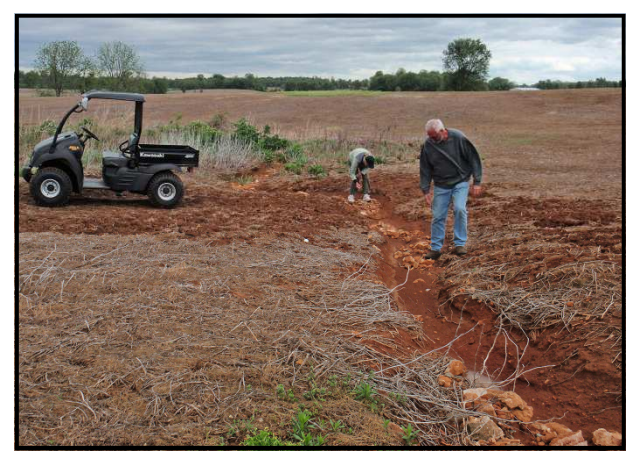
Looking for rocks and fossils in a washout before the field was planted with corn.

After a week of preparation in Florida for our yearly return to Kentucky, and after a few days in Kentucky, unpacking, organizing, repairing, and replacing vehicle and equipment batteries, we needed a break. So we jumped (not literally) into Peg's Mule and rode out into the field across the road in search of rocks, minerals, and fossils. The runoff from heavy rains over the winter and early spring created gullies where the soil washed away, leaving chunks of interesting rocks plainly visible. No digging was required, just carefully looking on the ground and trying to have an open eye