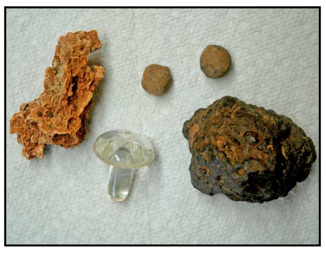
A few of our finds from the field washout.

coffee percolator, and the other is an interesting glass stopper with a big 57 cast on the top. We found an identical glass Heinz catchup bottle stopper on EBay selling for $20.42.