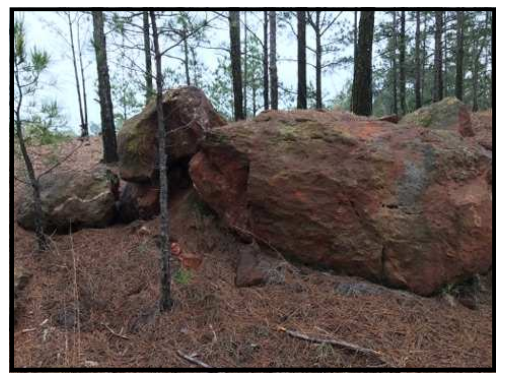
Typically colored boulders