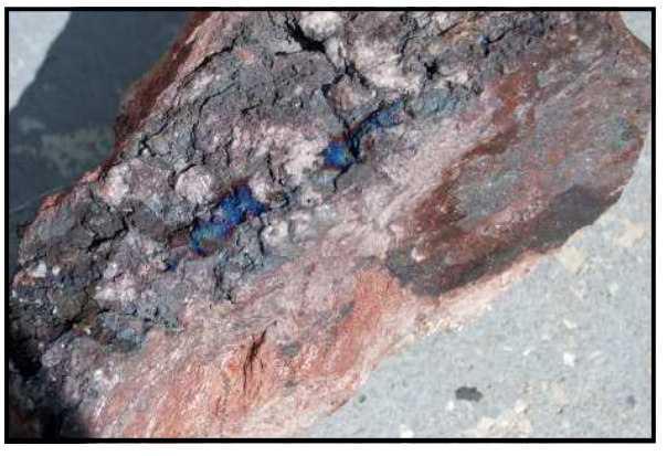
The approximately thirty pound piece of iridescent hematite after part of it was removed for transportation to the Moore's home.