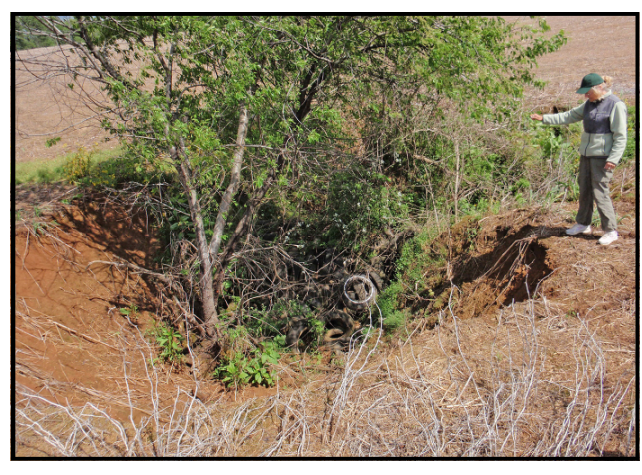
One of the smaller sinkholes.

While out on the field we rode around, inspecting both new and old sinkholes. Some are up to thirty feet deep, showing how far down the reddish colored soil extends along this wide valley floor. The newer sinkholes, created within the last several months, are only a few feet deep and a few feet in diameter, but in time, runoff will carve them deeper and much wider into the clay soil.