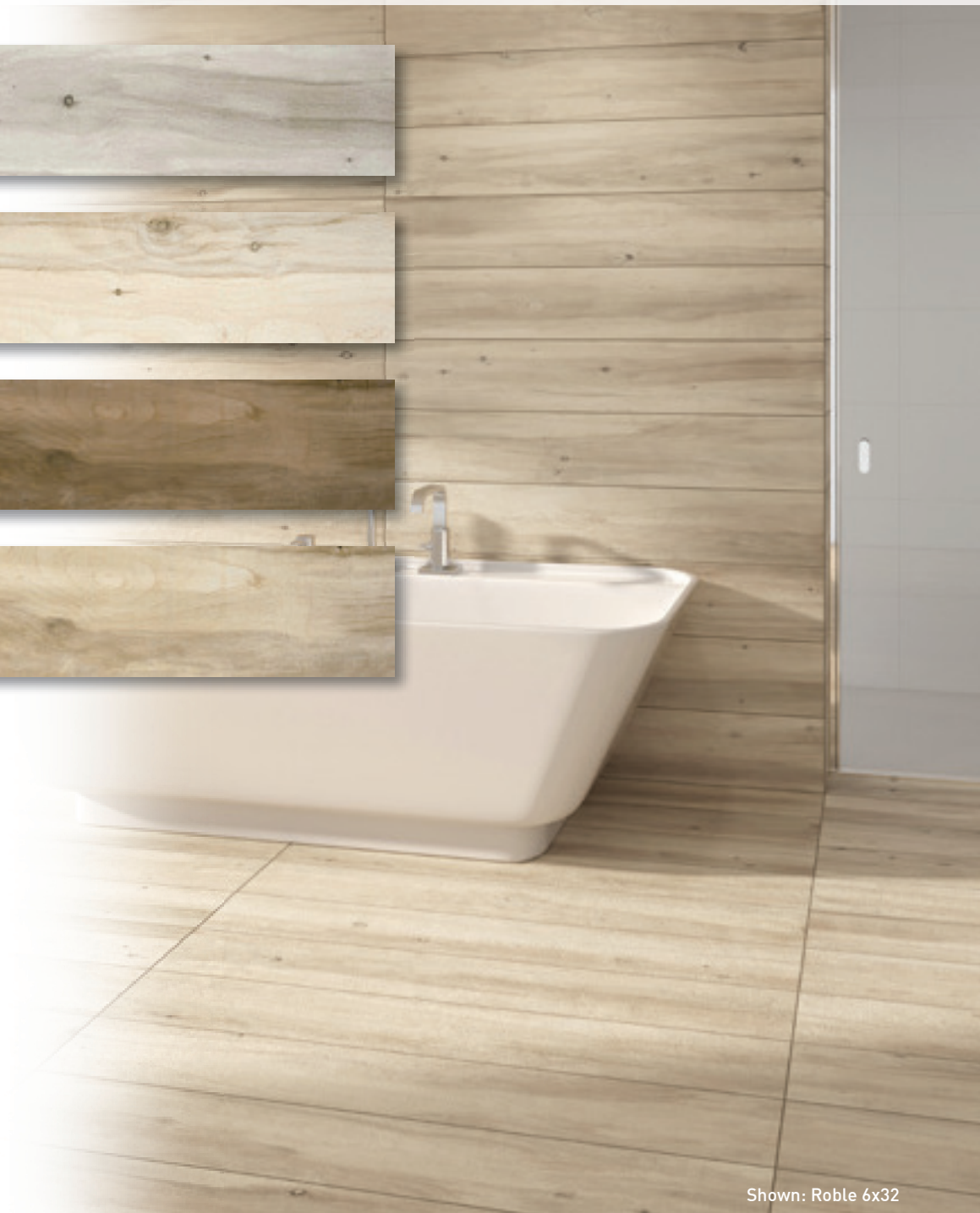
Shown: Roble 6x32