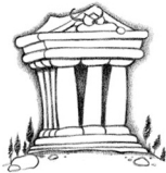
(This is the temple of the Philistines' god. Let's see what God has in mind for it!)

They forgot about God. They forgot about doing what pleases him. They didn't want God to rule over them, and so God sent the Philistines to rule over them instead. The Philistines made their lives miserable. It wasn't that God didn't love his people. They needed to know what life would be like without him.