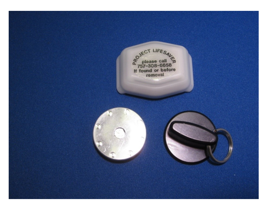
Components Transmitter case Transmitter Cap Transmitter Key