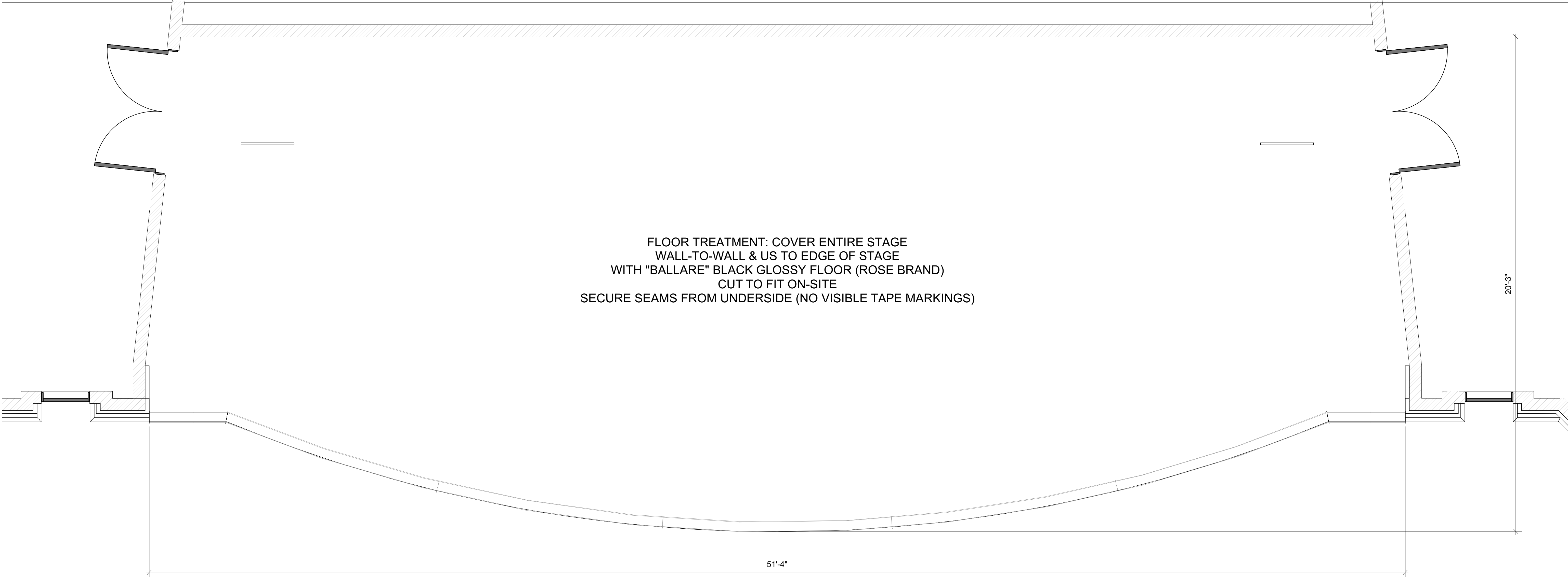
1 PLAN VIEW Scale: 1/2" = 1'-0"